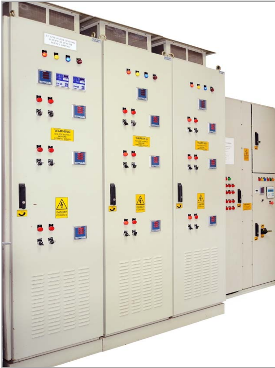
Phantom load testing facility of APFC panel

The unique features of proposed Active Harmonic Filters are as below: