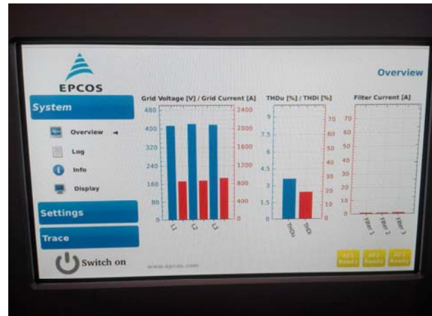
Pre-commissioning site harmonic readings