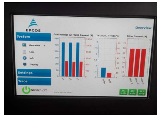
Post-commissioning site harmonic readings