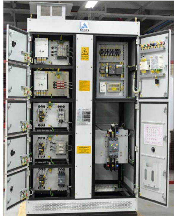
APFC panel construction with rack module