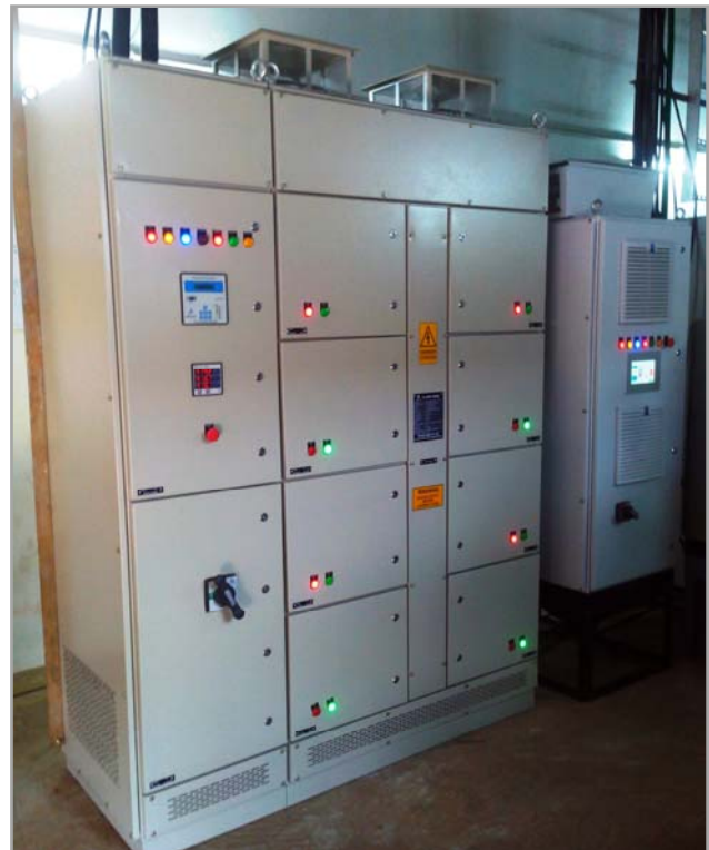
The hybrid PFC solution installation at site (left side detuned PFC system, right side Active Harmonic Filter)

The company management expressed their satisfaction to the consultant M/S LRVI solutions and M/S EPCOS India for the tailor-made power quality solution for the process industry.