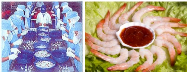
Shrimp selection and dish with delicious shrimp

A new era of seafood business started end of 1990 in the south of India in the small village Iskapally (Andhra Pradesh) with the foundation of a new company for seafood-processing. Especially a new type of aquatic species called Litopenaeus vannamei – white shrimp or white leg shrimp – has become famous as an excellent sea food not only in India, but all around the globe.